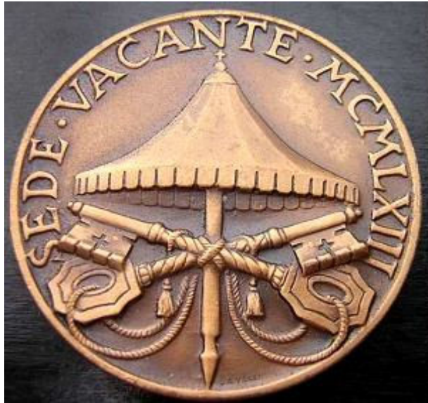
Medal commemorating the 1963 Sede Vacante issued after the death of Pope John XXIII and before the election of Pope Paul VI.

Many interpreters have read verse 45 and concluded that the 'king of the north' is simply 'planting the tents of his royal palace' between the seas of the Mediterranean and the 'Glorious Holy Mountain' preparing for a siege against Jerusalem. While a campaign is certainly intended, the seas are not the seas of the Mediterranean or any other body of water. The seas implied in this verse are symbolic of 'peoples, multitudes, nations and tongues' (Rev 17:15), over which the Papacy wishes to 'plant' his temporal and spiritual dominion. The 'Glorious Holy Mountain' mentioned in this verse, has been interpreted by commentators to signify Jerusalem in the middle east. But we have already seen that this prophecy is referring to the heavenly Mt. Zion, from which the light of the glory of the gospel in the face of Jesus Christ is streaming. The prophecy is not a two-dimensional picture of attack, it is a three-dimensional attack against 'the host of heaven', 'the Prince of the host', 'the place of His sanctuary' and 'the truth' which Daniel 8:10-11 has already made abundantly clear. That the waters are not any local body of water near Jerusalem is also confirmed when comparing Revelation 17:1, 15 which say: