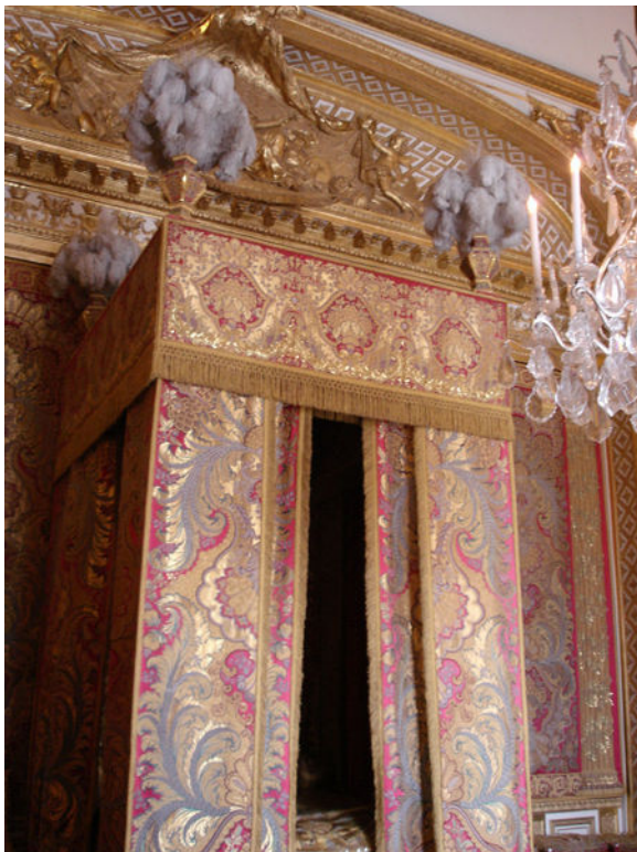
Canopy of state made of Baldachin fabric

The reason this bit of history is pertinent to the discussion of this verse is because the Papacy also wanted to be a ‘king of the kings’ and ‘lord of lords’ during this same time. During the height of Papal power, a symbol of his power and kingly authority was introduced. The umbraculum, or in Italian, ombrellone, or ‘big umbrella.’ It was made of ‘Baldachin’ – a luxurious type of cloth from Baghdad, from which the word is derived. It was made of gold and red cloth, and the umbraculum functioned as a mobile ‘canopy of state.’ It had its beginning as a cloth canopy, but in other cases it is a sturdy, permanent architectural feature. One such example is seen over the high altar at St. Peter’s cathedral in Rome.